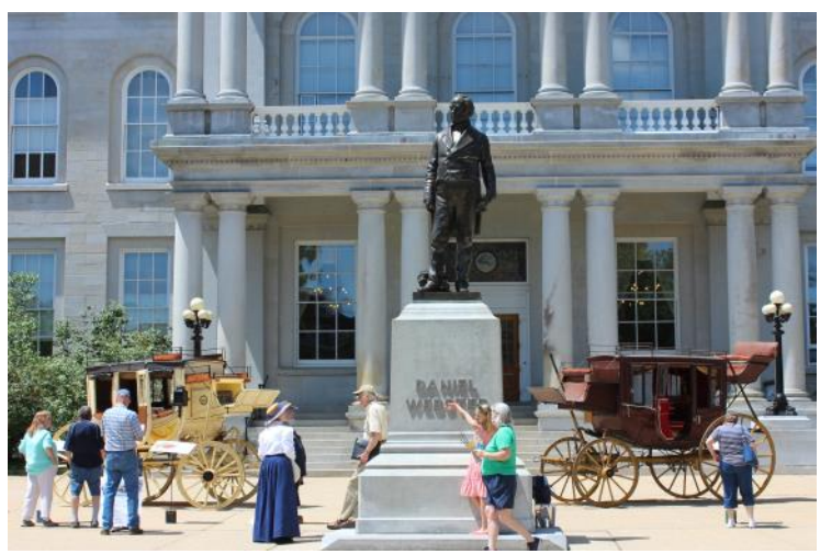
The two coaches in front of the New Hampshire State House flanking the statue of Daniel Webster

We participated in many events, most often with one or both coaches on public display. It generated tremendous interest with the many visitors and we picked up several new local members.