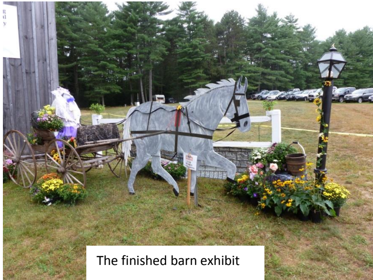
The finished barn exhibit

building. Esther Crowley, just back from a summer traveling in the west, pitched in to help Marsha put together the flowers and the mannikin. We did get awards for both exhibits!! We wish to thank Rocky's Hardware in Concord and Pleasant View Gardens for the many beautiful flowers that were used in the exhibit in front of the barn.