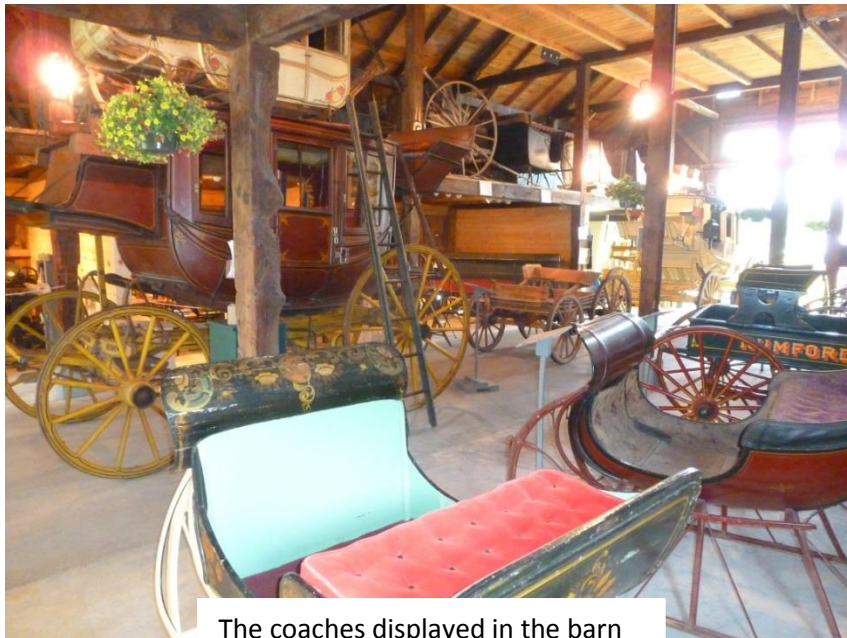
The coaches displayed in the barn

Next year we hope to have the wood lathe in the woodworking shop in operation and we can demonstrate its use. It is treadle operated and will be an attention getter for sure. We can make wooden tops to give to the kids. Wooden tops were popular in the stage coach era.