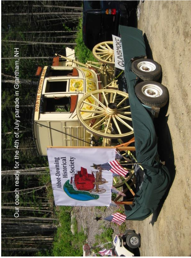
Our coach ready for the 4th of July parade in Grantham, NH