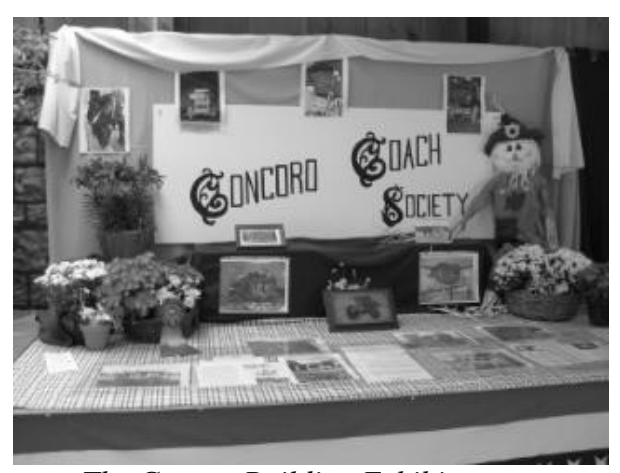
The Grange Building Exhibit

And, finally many of our members volunteered to greet and talk with the many visitors to our museum. It was a very successful 5 days and many people came and learned about the Concord Coaches and Abbot & Downing.